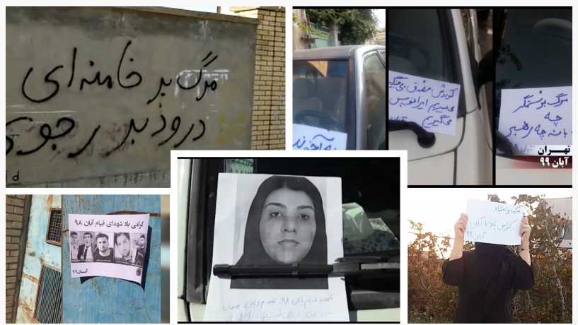
Tehran – Nov. 2020 “Death to Khamenei, Hail to Rajavi, Death to the Oppressor, be it the Shah or the Leader”