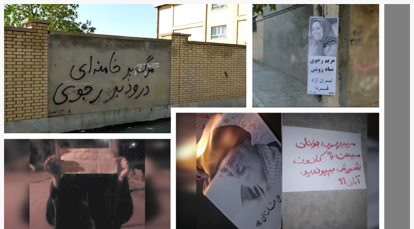
Tehran, Oct. 28, 2020: “Khamenei, shame on you, Hail to Cyrus the Great.”