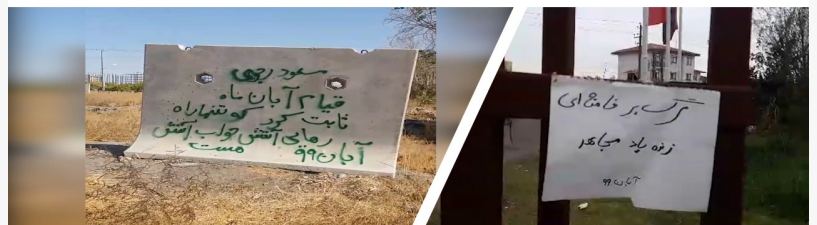
Nov. 2020: “Maryam Rajavi: Nation’s youth join the Resistance Units.”