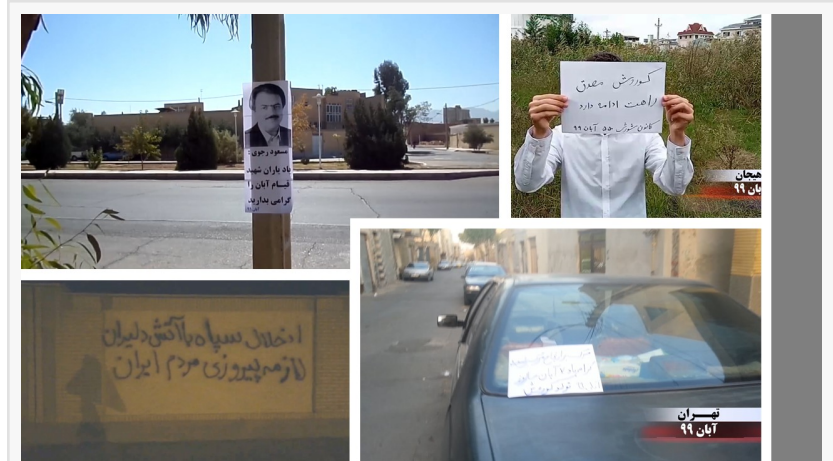
Tehran – Nov. 2020: "Massoud Rajavi: Let us keep the memory of our friends martyred in Nov. 2019 alive,"

PARIS, FRANCE, November 3, 2020 /EINPresswire.com/ -- On the brink of the anniversary of the November 2019 uprisings , over the past week, supporters of the main opposition Mujahedin-e Khalq (MEK) and Resistance Units have been putting up posters and banners and writing graffiti echoing the Iranian people's demand for the overthrow of the inhumane clerical regime and expressing support for Maryam Rajavi, the President-elect of the National Council of Resistance of Iran (NCRI).