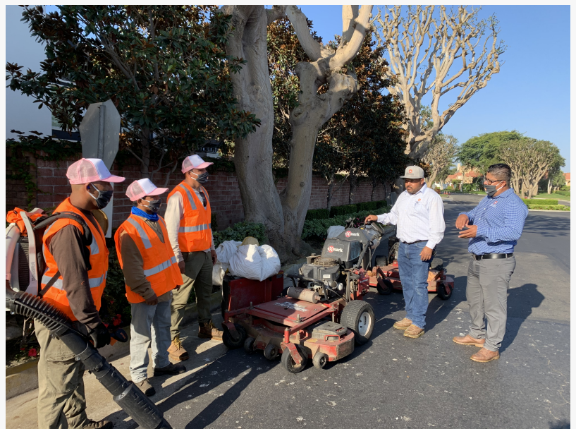
Harvest Landscape hard at work.