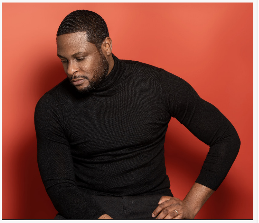
Known as Best-Selling Author in Men's Health