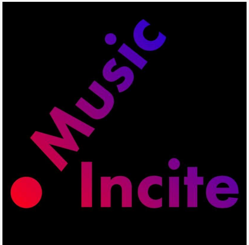
MusicIncite Color Logo