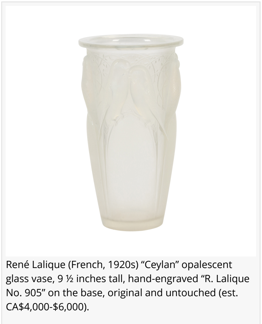
René Lalique (French, 1920s) "Ceylan" opalescent glass vase, 9 ½ inches tall, hand-engraved "R. Lalique No. 905" on the base, original and untouched (est. CA$4,000-$6,000).

All prices quoted are in Canadian dollars.