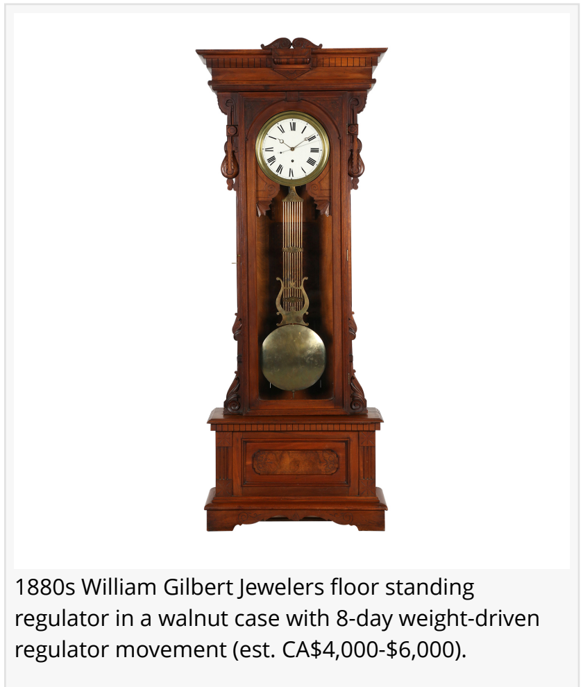
1880s William Gilbert Jewelers floor standing regulator in a walnut case with 8-day weight-driven regulator movement (est. CA$4,000-$6,000).

Wonderful decorative accessories will be highlighted by a René Lalique (French, 1920s) "Ceylan" opalescent glass vase, 9 ½ inches tall, hand-engraved "R. Lalique No. 905" on the base, original and untouched (est. $4,000-$6,000); and a lovely Cartier (French, 1930s) three-piece marble shelf