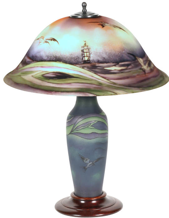
1920s Pairpoint reverse painted "Copley" table lamp with acid-etched glass shade (19 ½ inches diameter) with ocean and seagull decoration, on a bronze base, signed (est. CA$2,500-$3,500).

This press release can be viewed online at: https://www.einpresswire.com/article/530071302