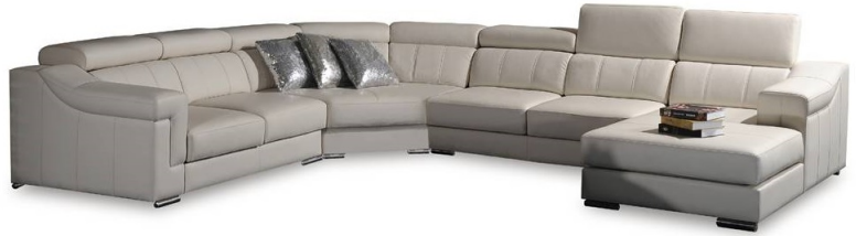
White Sofa, the Custom Sofa Centre

The Custom Sofa Centre is fully Australian owned and operated, and the company prides itself on providing affordable sofas to all Australian families. That is why the Custom Sofa Centre offers extensive sales on select styles up to 50% off, with online vouchers for an extra 10% savings and payment plan options for up to two years with 0% interest. As they continue to