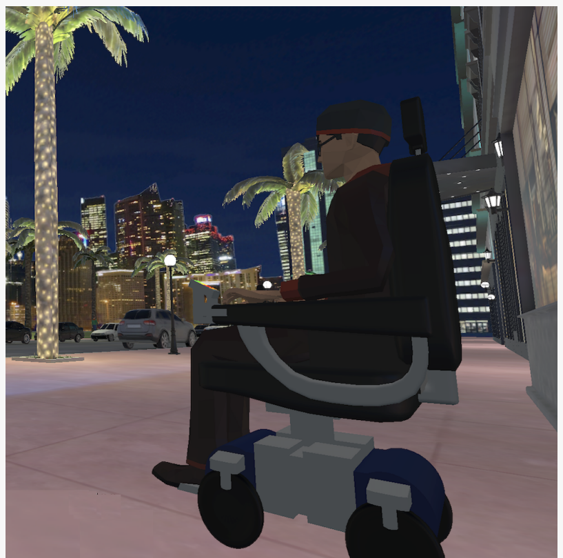
Wheelchair Mobility Experience Icon