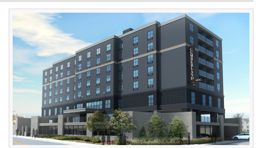
The former Four Points Sheraton received a $12 mil renovation to become Cumberland House Knoxville, Tapestry Collection by Hilton

KNOXVILLE, TN, USA, November 9, 2020 /EINPresswire.com/ -- The sleek and modern Knoxville hotel near UT is located in the heart of downtown Knoxville and is the latest addition to Tapestry Collection by Hilton, one of Hilton's 18 market-leading brands. The seven-story, 130-room hotel is walkable to the Knoxville Convention Center, University of Tennessee, World's Fair Park and Market Square.