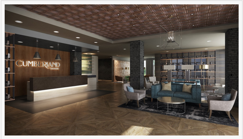
The lobby of Cumberland House Knoxville pays tribute to the artistry, creativity, and possibility of the historic Knoxville textile and button manufacturing industry.