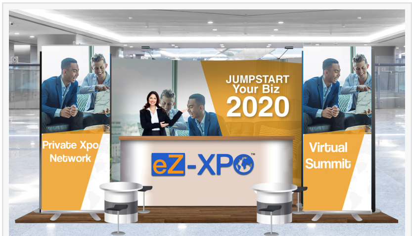
Virtual Exhibit Hall - Virtual Lobby Session Track

In Matthew 18:20, Jesus defines His Church or Ekklesia as two or three people gathered in His presence to enact His will on the Earth. Jesus’ Ekklesia was a building-less mobile people movement operating 24/7 in the marketplace to impact everybody and everything with the message of transformation. Today through our movement we are seeing ordinary people doing extraordinary things as they play a vital role in the ending of systemic injustice in all seven spheres of society- Business, Government, Education, Healthcare, Local Church, the Family and