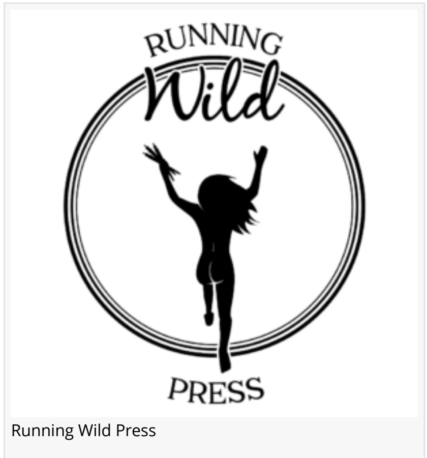
Running Wild Press