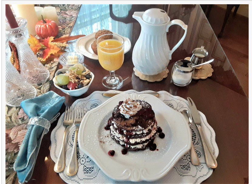
Vanilla Ricotta Creme Hot Chocolate Pancakes with Berry Sauce is one of many recipes you'll find on the blog at Holden House