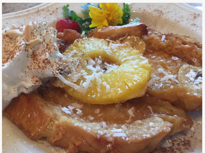
Holden House is known for it's delicious breakfast treats

Holden House 1902 Bed & Breakfast Inn was established in 1986 by the Clark's and continues to operate as the longest established bed and breakfast inn in the area. The award-winning inn provides high marks for housekeeping and boasts a 5 star rating from TripAdvisor as well as awards for Best of Housekeeping 2020 by AAA. The inn features six unique and spacious guest suites with private baths, king or queen beds, fireplaces, and some suites include oversized tubs for two and balconies. A full gourmet breakfast is included in the rate with an optional breakfast served in your suite for an additional fee. In addition, an afternoon snack and beverage and bedside home baked cookies are just a few of the Holden House special touches. The inn includes three side-by-side Victorian homes with a turreted main house, adjacent Victorian and carriage house, offering privacy and boutique-style accommodations.