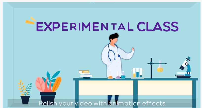
Animation Maker Mango Animate-3

Crowdfunding has grown popular, making it challenging to earn the trust of the investors who need to put their money into users' projects. Mango Animate has made it easy for users to design captivating stories through videos in order to compel prospective funders to invest. The animation maker allows them to add visual elements to make their story intriguing. Their animated videos can back up their crowdfunding campaigns. They will gain by introducing and explaining their projects in a simple way, making an impression, establishing their identity, and getting indexed on platforms like YouTube and Google.