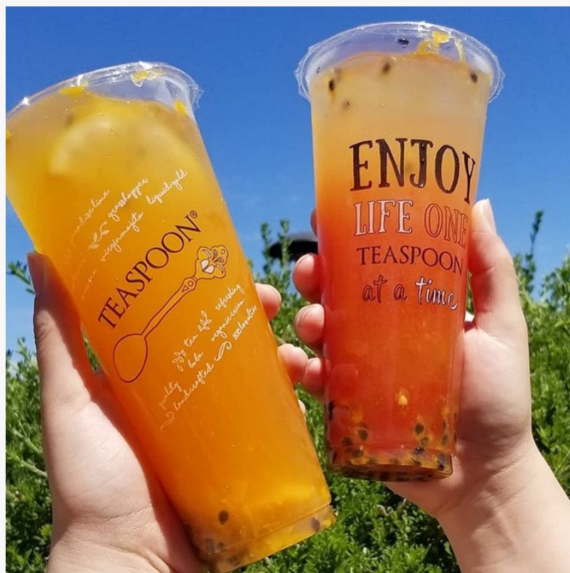
All boba at Teaspoon is made in the USA.