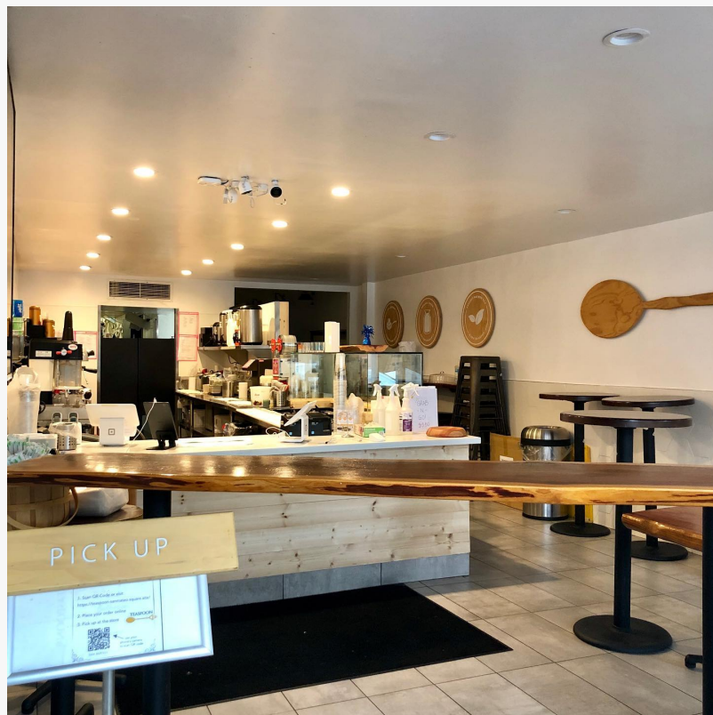
Inside look at one of the 19 Teaspoon locations.