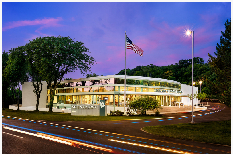
The Church of Scientology Central Ohio in Columbus opened November 9, 2019

This press release can be viewed online at: https://www.einpresswire.com/article/530499308