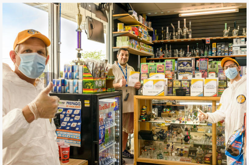
Scientology Volunteer Ministers bring copies of educational booklets to shops for their customers to use.

All three booklets are available to be read or downloaded free of charge in 21 languages from