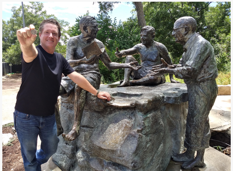
Find an ordinary item at a unique location, win $10,000

This press release can be viewed online at: https://www.einpresswire.com/article/530506192