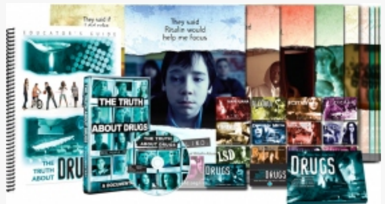
Foundation for a Drug-Free World free education package for schools and groups