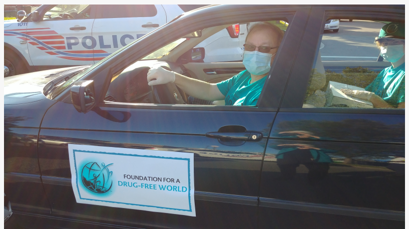
Drug-Free World volunteers helping police in Washington, DC

WASHINGTON, DISTRICT OF COLUMBIA, UNITED STATES, November 12, 2020 /EINPresswire.com/ -- While communities across the country struggled with how to give children the Halloween experience this year, the Metropolitan Police Department of the District of Columbia met the challenge head on with their “ Trunk or Treat Safe Haven ” events while also maintaining the COVID-19 hygiene protocol of social distancing.