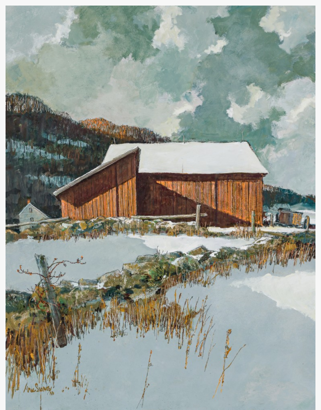
Oil on Masonite painting by Eric Sloane (American, 1905-1985), titled New England Red, circa 1978, signed, 36 inches by 28 inches (est. $10,000-$15,000).