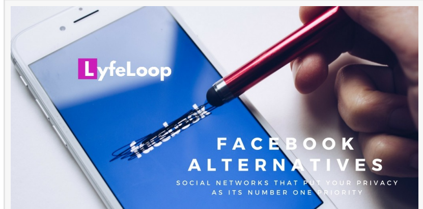
Best Facebook Alternative in 2020 is Lyfeloop

LyfeLoop gives users everything they loved about other platforms minus all the censorship, fake fact checking, bias, and security issues. Over the past few years the largest social media platforms have lost the trust of millions of their users for numerous reasons including: selling user data to 3rd parties, banning accredited users while allowing spammers to run free, discrimination (political, medical, religious), and having a total disrespect for their user's safety.