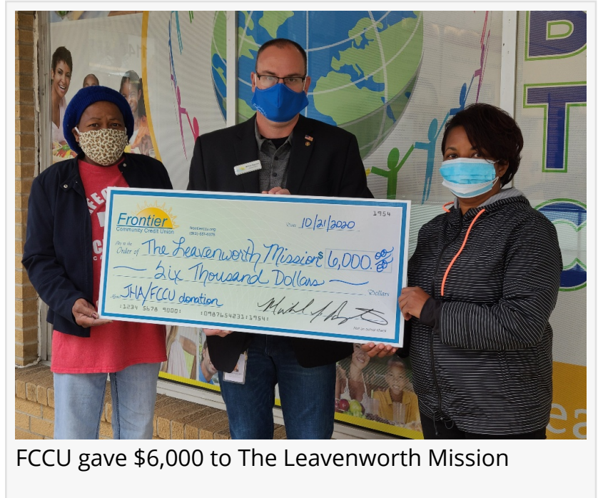
FCCU gave $6,000 to The Leavenworth Mission