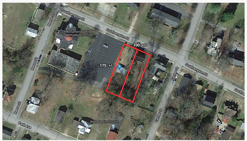
3 bedroom 2 bath 2,760± sq. ft. home on a .40± acre double lot at 308 Southampton St., Emporia, VA

Nicholls Auction Marketing Group, Inc., is a professional accelerated marketing firm specializing in the promotion and sale of real estate via the auction method of marketing. Headquartered in Fredericksburg, VA, NAMG has been serving the needs of the Mid-Atlantic region since 1968. The Nicholls team comprises world and state champion auctioneers, an award winning marketing staff, and sales percentages unmatched in the industry. For more information about Nicholls Auction Marketing Group, Inc., visit www.nichollsauction.com or call 540-898-0971.