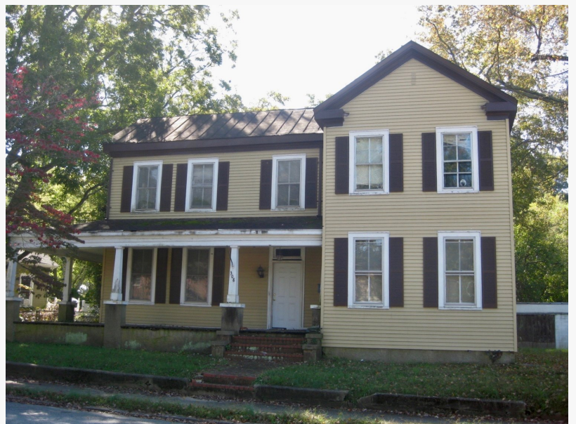
3 bedroom 2 bath 2,760± sq. ft. home on a .40± acre double lot at 308 Southampton St., Emporia, VA

The real estate auction is open for on line bidding. Brokers are reminded that pre-registration is required for compensation.