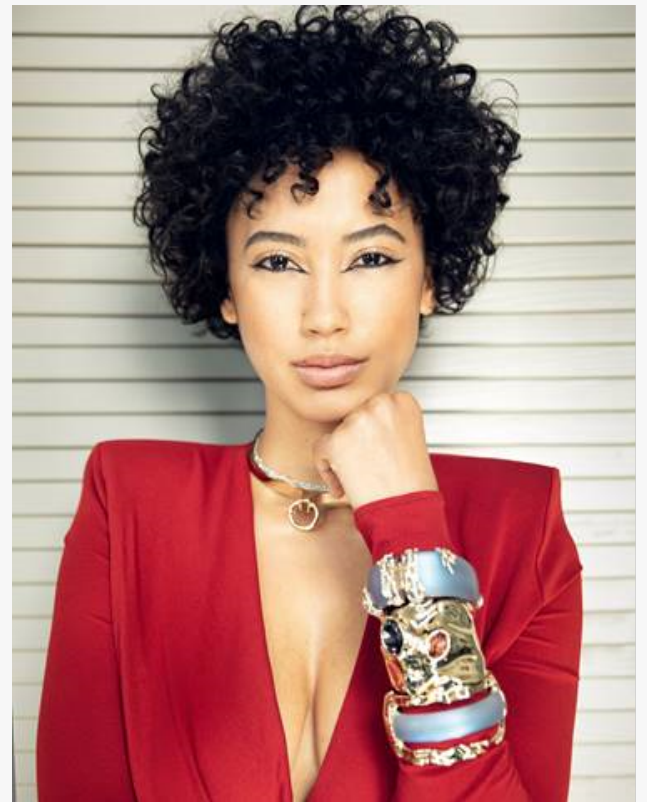
Film2Future 2020 Virtual Gala Host Andy Allo