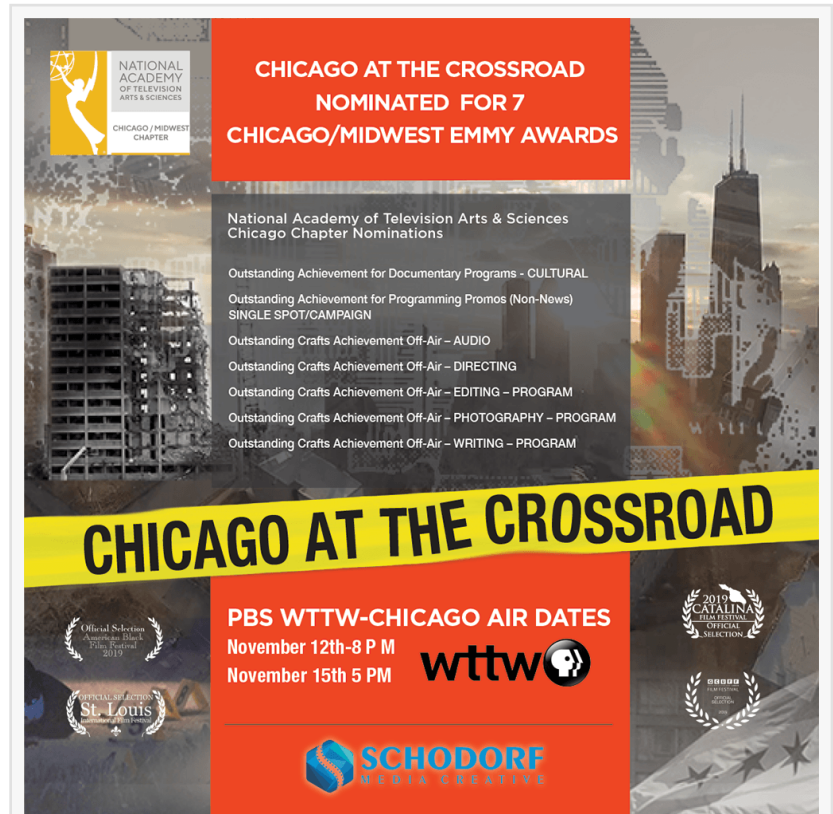
Seven Emmy nominations 2020 / Chicago at the Crossroad documentary