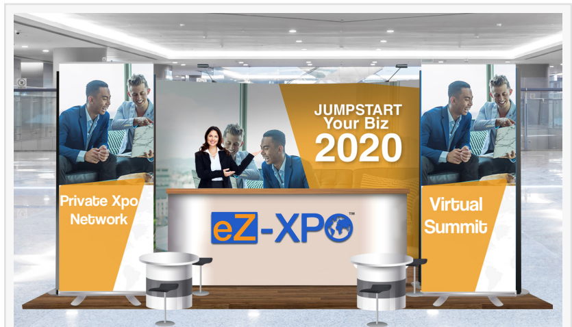
Virtual Exhibit Hall - Virtual Lobby Session Track

For more information on AWE-Mexico, please visit https://www.dreambuildermexico.org/