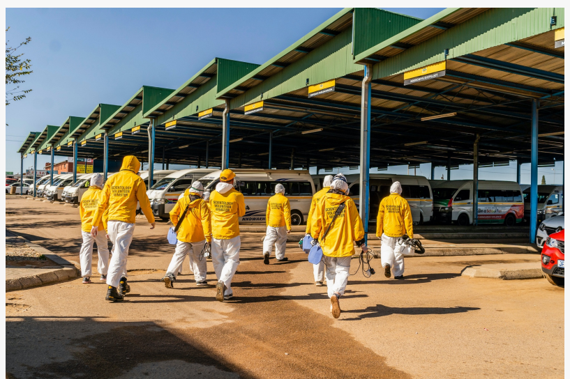
VMs arrive at taxi ranks.

To make this prevention information broadly available, the Church of Scientology created more than a dozen videos and three educational booklets: How to Keep Yourself & Others Well, How to Protect Yourself & Others with a Mask & Gloves and How to Prevent the Spread of Illness with Isolation. Scientology Volunteer Ministers of South Africa have distributed more than a million copies of these booklets. These are available to read or download free of charge in 21 languages including Zulu, Sotho and Xhosa through the How to Stay Well Prevention Resource Center on the Scientology website at www.scientology.org/staywell/ .