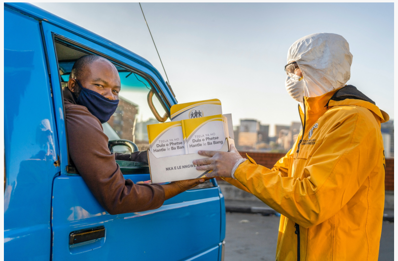
Volunteer Ministers fog and provide copies of Stay Well booklets to taxis.