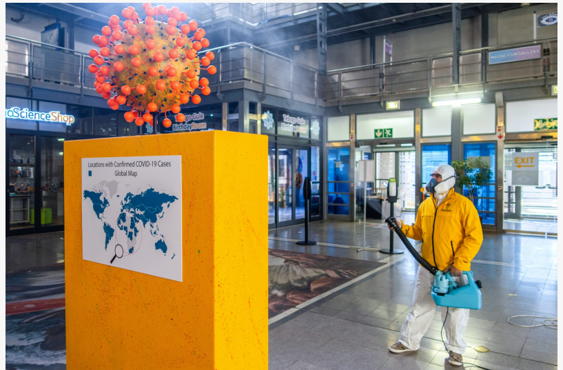
Volunteer Ministers fog high-traffic locations with decontaminant to prevent the spread of the virus.

Taxis are a vital service in South Africa, transporting an estimated 75 percent of the country's population every day. Volunteer Ministers have sanitized thousands of taxis daily—their record