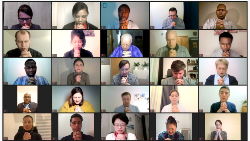
Participants in the 3rd Global Prayer Service of Religious People(2)