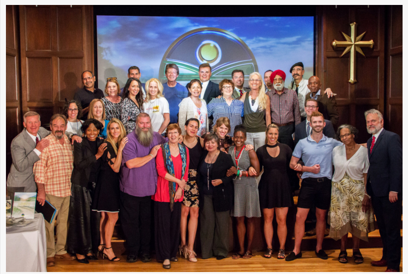
Before the pandemic, the Nashville Church of Scientology frequently hosted interfaith programs.

common problems and gain professional development opportunities. For example, just before the pandemic, the Nashville chapter of RCC cohosted a Faith in Harmony Sunday Service February 9 at the <u>Church of Scientology Nashville</u> for World Interfaith Harmony Week.