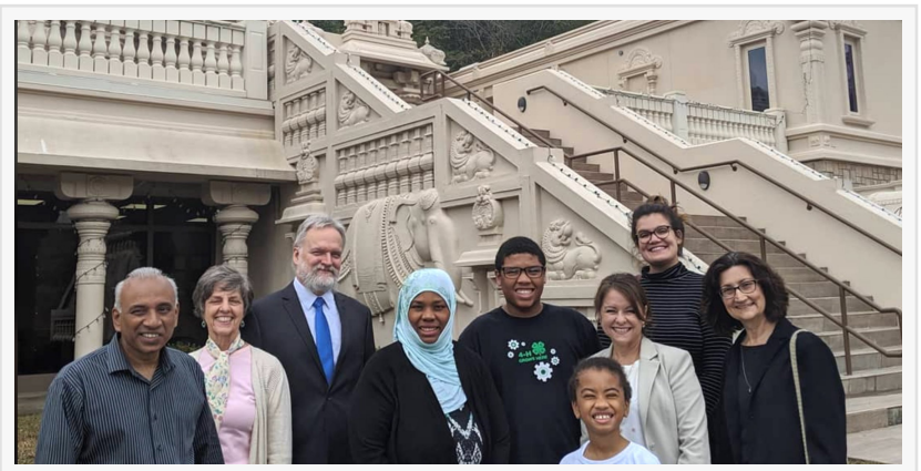
Nashville chapter of RCC toured Sri Ganesha Temple and learned about Hindu philosophy and principles.

Nashville chapter members increase their own understanding of other faith traditions, learn from fellow communicators, help one another with