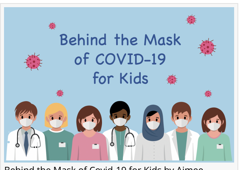
Behind the Mask of Covid-19 for Kids by Aimee Carroll

Author Carroll said: "This book was challenging because it had to balance two competing objectives. First, I didn't want the book to scare kids with menacing virus illustrations and potential serious health outcomes. Second, I wanted to ensure the book treated today's pandemic with enough seriousness to spark action."