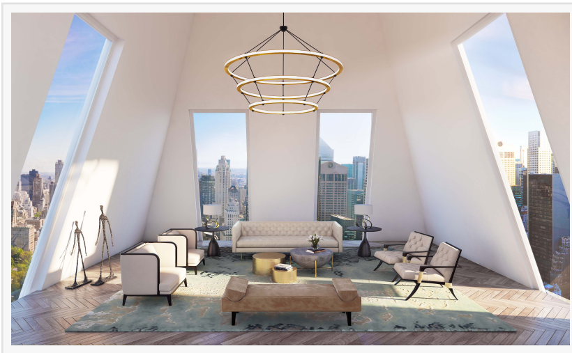
Perched thirty-seven floors above the 50-yard line of Central Park South on Billionaire's Row.

"This is the ultimate trophy property. All of the work has been done in advance for the next owner, including award-winning plans by a renowned