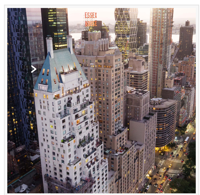
Welcome home to the most iconic triplex penthouse of New York City.