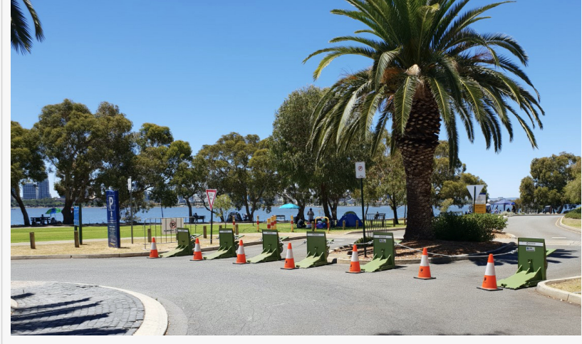
Meridian's mobile barriers in use at Perth's Australia Day event.

Rose Bowl football stadium in Pasadena, California safe for fans. "We always use the Meridian barrier because it doesn't stand out. It doesn't look like this thing that doesn't fit in the area," he said.