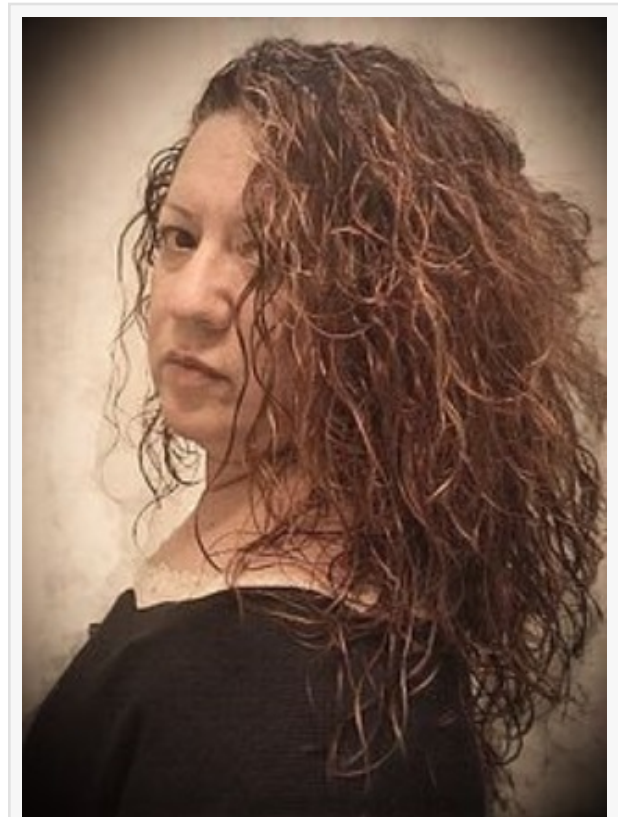
Author Cynthia A. Morgan

This press release can be viewed online at: https://www.einpresswire.com/article/530904202