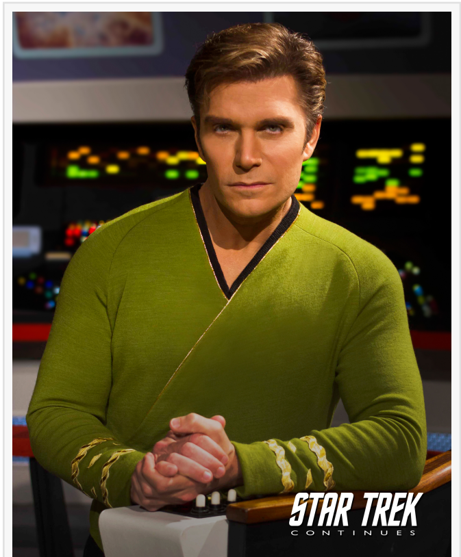
Vic Mignogna of Star Trek Continues now stars in 28-hour audio book documenting making of the original Star Trek.