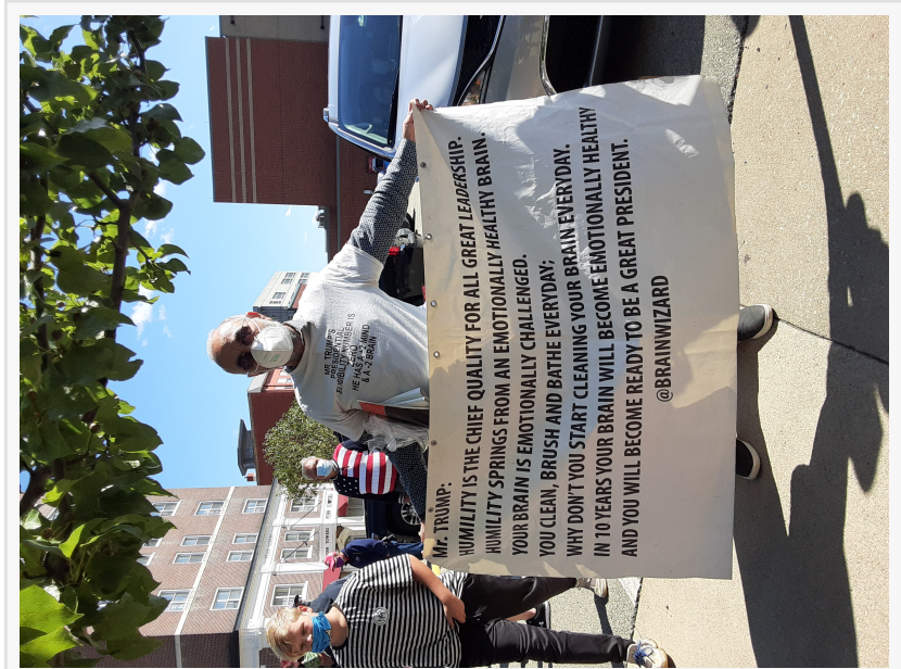
This is the truth about Trump.

Here is a fail proof plan to accomplish what no leader has done ever before, solve once & for all America's #1 problem of America being an emotionally challenged country."