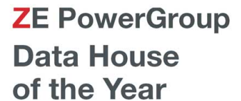
Data House of the Year ER Award 2020