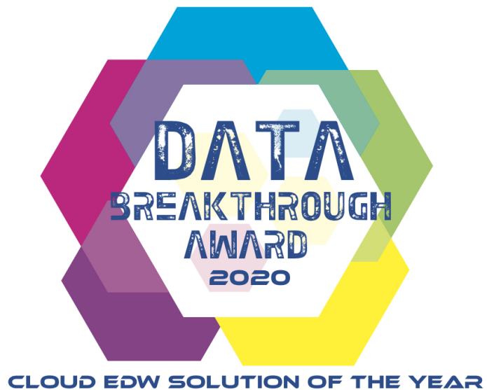
ZE PowerGroup Wins 2020 Data Breakthrough Award