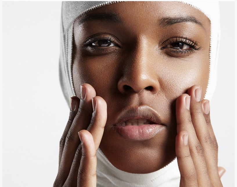
Plastic Surgery Face-Bisset & Holland