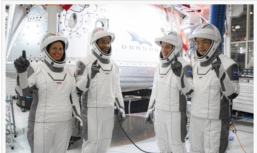
SpaceX Crew Dragon team: Shannon Walker, Victor Glover, Michael Hopkins and Soichi Noguchi

NEW YORK CITY, NEW YORK, UNITED STATES, November 18, 2020 /EINPresswire.com/ -- When the Genius 100 community was established in 2017, Japanese Astronaut Soichi Noguchi was “on board” to help. And now, three years later, we are so proud to congratulate Dr. Soichi Noguchi on his third mission aboard the SpaceX Crew Dragon spaceship.