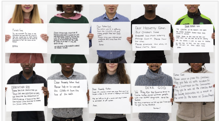
Prayers from SCJ members internationally for a better tomorrow