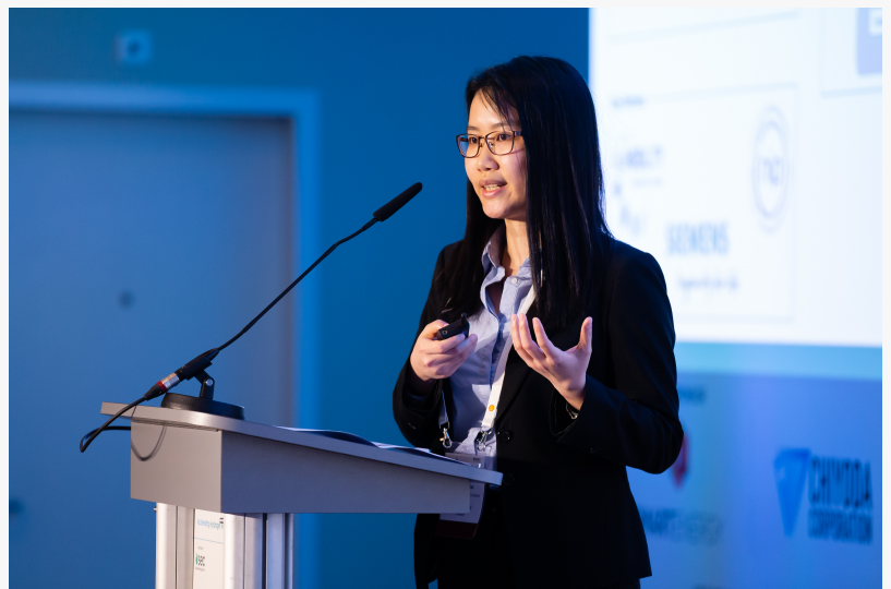
1st Annual Asia-Pacific Hydrogen Summit Speaker on Stage

The Summit is sponsored by Mitsubishi Heavy Industries, Chiyoda Corporation, Shearman & Sterling, Star Scientific, Sarawak Energy, Intercontinental Energy and Hexagon Purus as well as having the support of multiple industry associations including Hydrogen New Zealand, BloombergNEF, Eco Voice, NWBA, Renewable Hydrogen Alliance, Asia Wind Energy Association, Alles Over Waterstof, Colorado Hydrogen Network, and the International Hydrogen Aviation