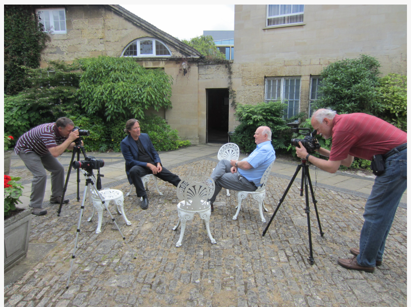
John Lennox and Kevin Sorbo during filming of Against the Tide

Fathom is a recognized leader in the entertainment industry as one of the top distributors of content to movie theaters in North America. Owned by AMC Entertainment Inc. (NYSE: AMC); Cinemark Holdings, Inc. (NYSE:CNK); and Regal Cinemas, a subsidiary of the Cineworld Group (LSE: CINE.L), Fathom operates the largest cinema distribution network, delivering a wide variety of programming and experiences to cinema audiences in all of the top U.S. markets and to more than 45 countries.