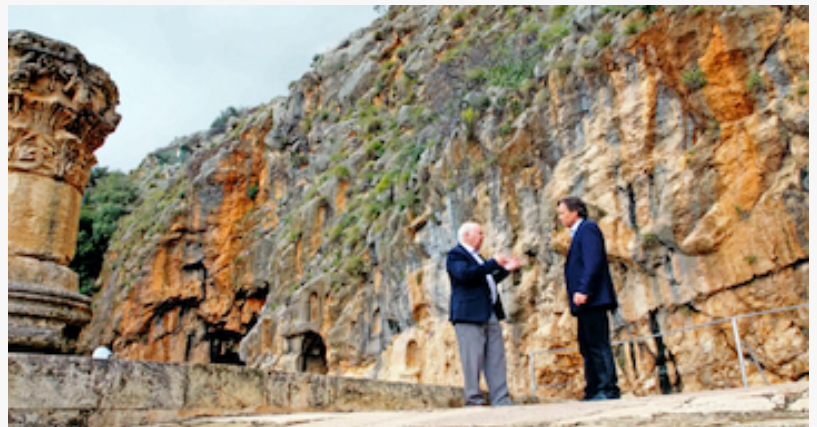
Kevin Sorbo and John Lennox Explore Caesarea Philippi