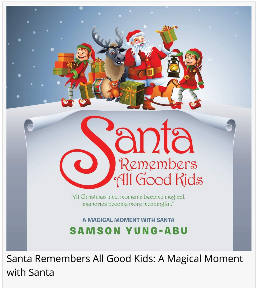
Santa Remembers All Good Kids: A Magical Moment with Santa