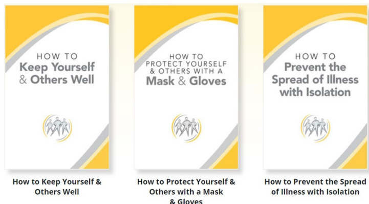
"How to Stay Well" COVID-19 educational booklets