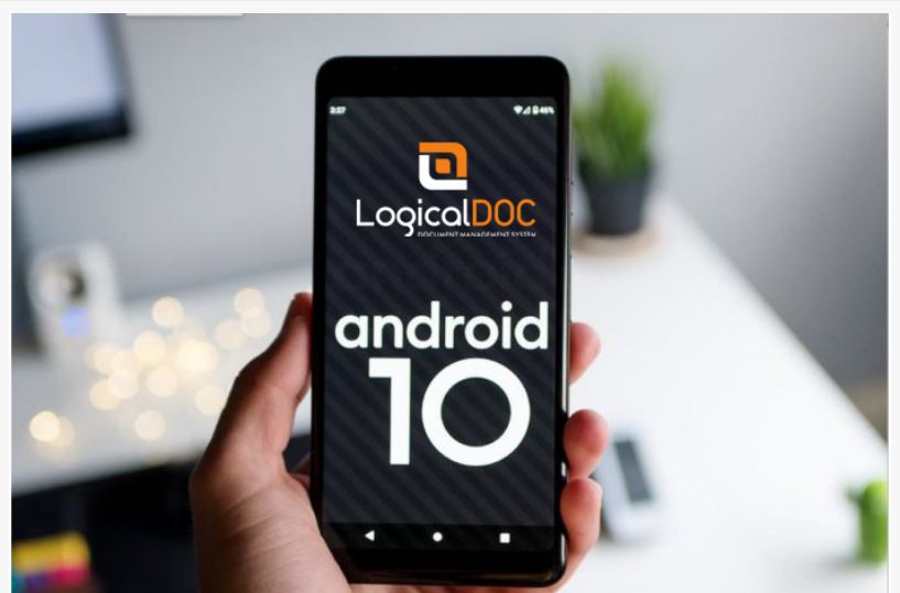
Smartphone with LogicalDOC logo and Android 10

When accessing the LogicalDOC Mobile app for the first time, the app asks the user to create an account. the app presents the users with a screen to enter the connection parameters to the