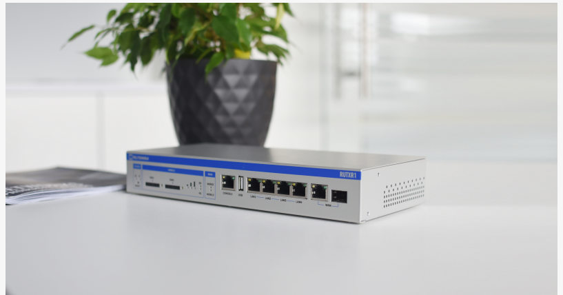
RUTXR1 – ENTERPRISE SERIES RACK MOUNTABLE CELLULAR ROUTER

KAUNAS, LITHUANIA, November 23, 2020 /EINPresswire.com/ -- We are Teltonika Networks : an ambitious company with a focus to provide secure, reliable, and easy to use networking equipment. Over two decades, we have launched a variety of new products, including cellular routers with an array of different features, cellular modems for easy but reliable connectivity, cellular gateways to support industrial applications, and even Remote Management System (RMS) to access the devices from anywhere in the world. But today, we are introducing something completely different. Please give a warm welcome to our first-ever rack mountable cellular enterprise router with SFP port - RUTXR1 !