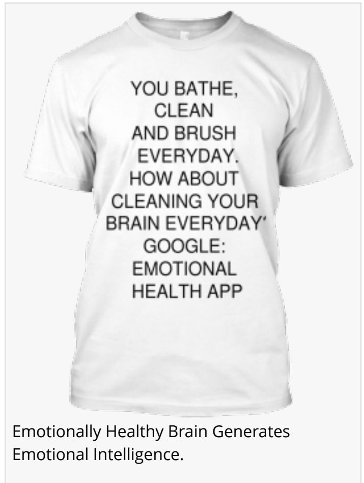
Emotionally Healthy Brain Generates Emotional Intelligence.

There is a straightforward trick that changes wisdom from being a philosophy to wisdom becoming a science. Wisdom and emotional intelligence are the same, and an emotionally healthy brain generates them. So define wisdom as EMOTIONAL HEALTH. Focus on emotional health and wisdom will emerge effortlessly.