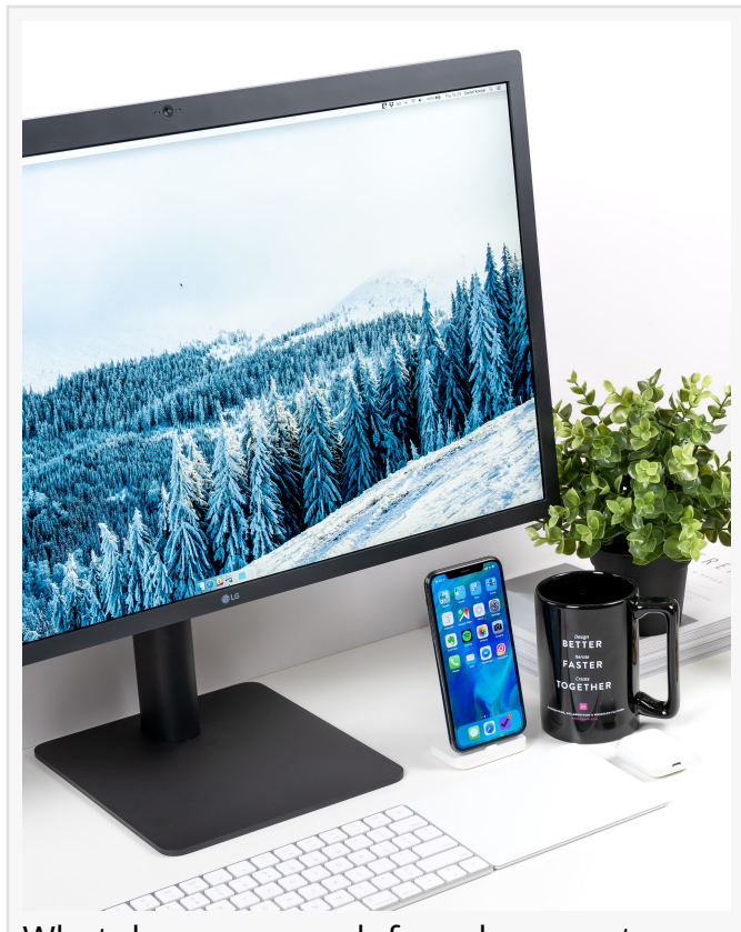
What does your work-from-home setup look like?

Consider your personal life situation right now. How do you fit into each of these work styles? It is important to carefully assess where you stand in the job market with each of these work styles. Here are a few things to keep in mind when choosing your individual work style: