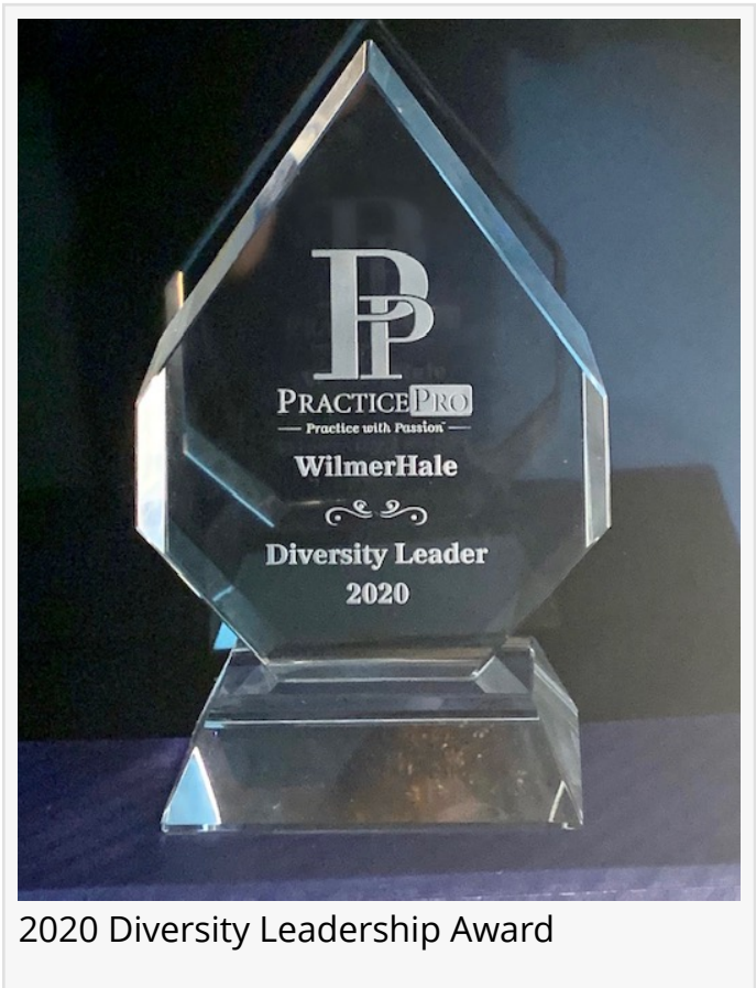
2020 Diversity Leadership Award

WilmerHale is one of only a handful of large law firms to have a woman co-managing partner, and part of an even smaller number of such firms that have had both a woman and a person of color as a co-managing partner. WilmerHale has also achieved Mansfield 3.0 Certification Plus status for three years in a row for having at least 30 percent of their key leadership and committee positions held by lawyers who are women, people of color, or LGBTQ+. In 2020,