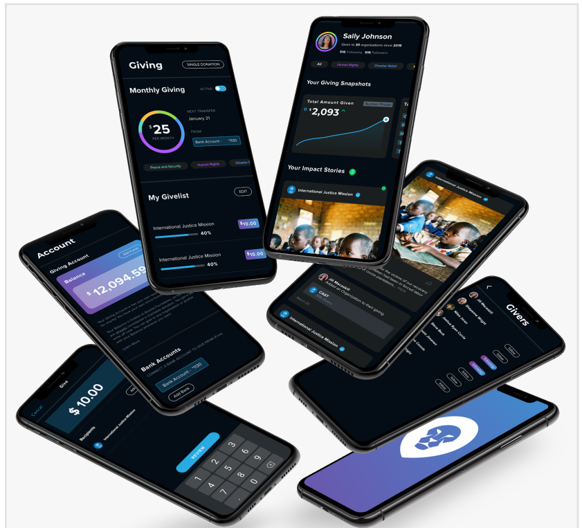
Givelist app is available on iOS and Android.

Givelist app is the only complete donation platform made for the 99%, with Giving Accounts, Impact reporting, a discovery process that allows you to find new charities and causes, and a social aspect to see where your community is giving. Headquartered in Santa Monica, California,