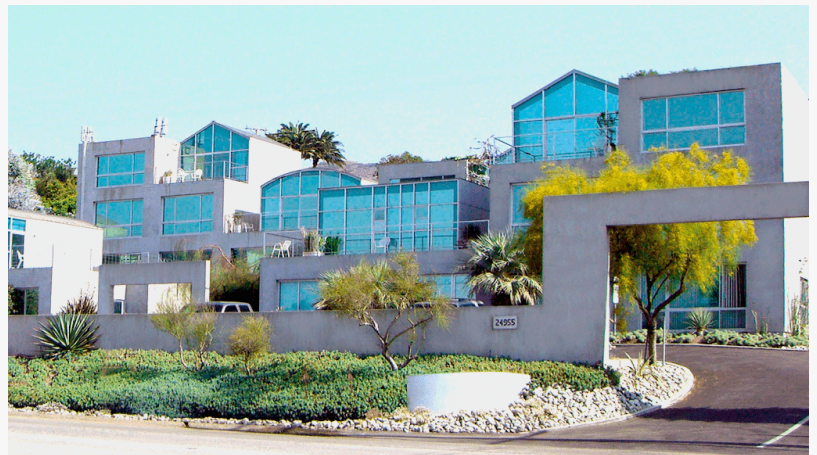
Givelist app offices located in Santa Monica, California.

This press release can be viewed online at: https://www.einpresswire.com/article/531325782