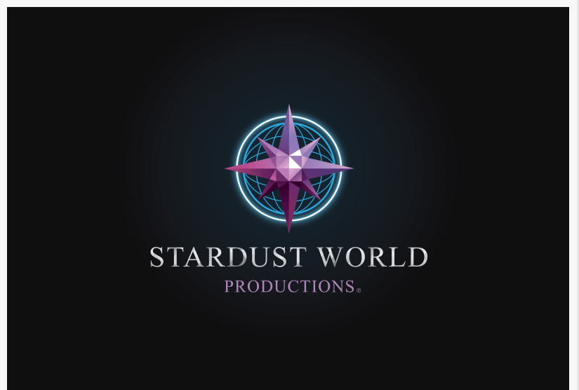
Stardust World Productions

While Stardust World Productions is a female-focused label, it is inclusive of all genders. The label’s vision is to develop a roster filled with the best women and men in the entertainment industry — those who will lift women up and open doors, helping them reach their greatest potential.