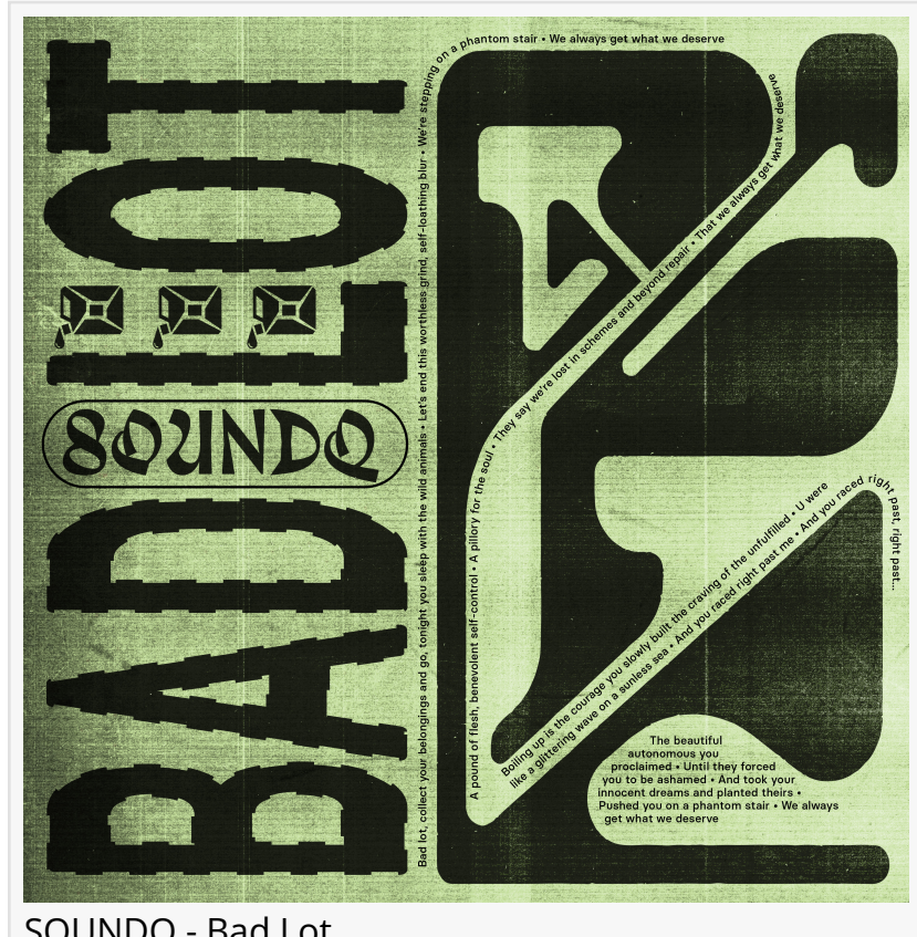
SOUNDQ - Bad Lot

Łukaz Czarnecki's clip for "Bad Lot" is just as bold. The clip opens with a near-apocalyptic image: young people, supine on a city street, with shattered glass and broken wood strewn all over the scene. Yet they won't be held down. Before long, they're on their feet in a shattered, dangerous, gorgeous Kraków, driving old-model cars across suspension bridges, crashing through tunnels, and dancing in the car parks of the industrial zone. Maybe Czarnecki is incapable of taking a shot of Kraków