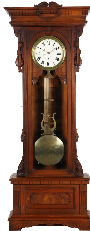
1880s William Gilbert Jewelers floor standing regulator in a walnut case with 8-day weight-driven regulator movement (CA$8,850).