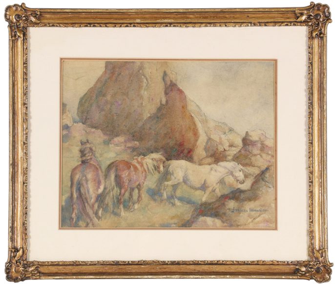
Original painting signed by the renowned Western American artist Frederic Remington (1861-1909), depicting horses moving through rocky terrain, done in the 1890s (CA$8,850).

Miller & Miller Auctions is Canada's trusted seller of high-value collections and is always