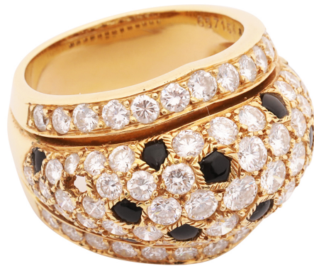
Cartier Nigeria 18kt white gold diamond and onyx dress dome ring (French, 1970s), having brilliant cut diamonds enhanced with black onyx spots representing a panther's skin (CA$7,080).

This press release can be viewed online at: https://www.einpresswire.com/article/531477948