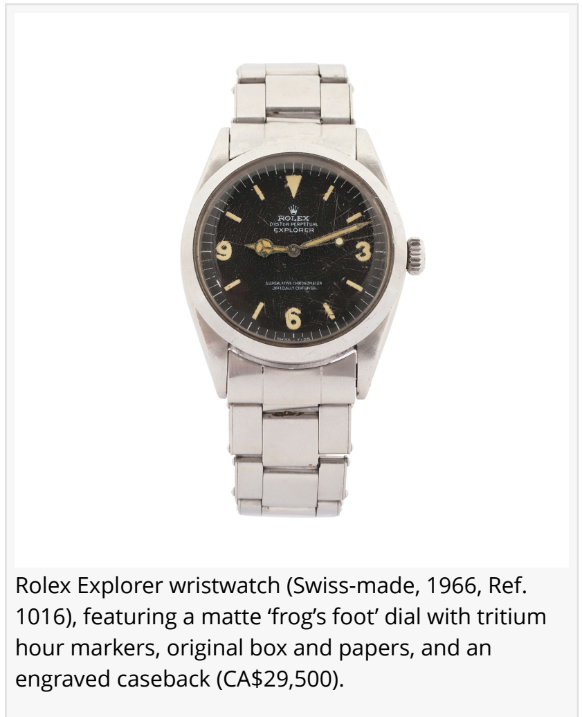
Rolex Explorer wristwatch (Swiss-made, 1966, Ref. 1016), featuring a matte 'frog's foot' dial with tritium hour markers, original box and papers, and an engraved caseback (CA$29,500).

The stainless-steel Rolex Oyster Perpetual Explorer, from 1966, was the auction's top lot. It boasted a matte 'frog's foot' dial with tritium hour markers and original creamy luminous hands. The caseback was engraved to the previous owner. The Omega Speedmaster, from 1962, was the sale's runner-up top lot. It featured "DON" (dot-over-ninety) bezel and alpha hands, caliber 321 movement, and a non-Omega steel band. The caseback was also engraved to the previous owner.