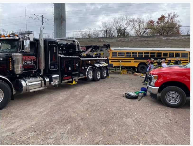
Decommissioned bus donated by Durham School Services used for multijurisdictional fire department extrication training.

"This training could not occur without the support of companies, like Durham School Services, who are willing to donate old decommissioned buses. We thank them very much for their generosity. We also thank Terry's Towing for their assistance. It will allow